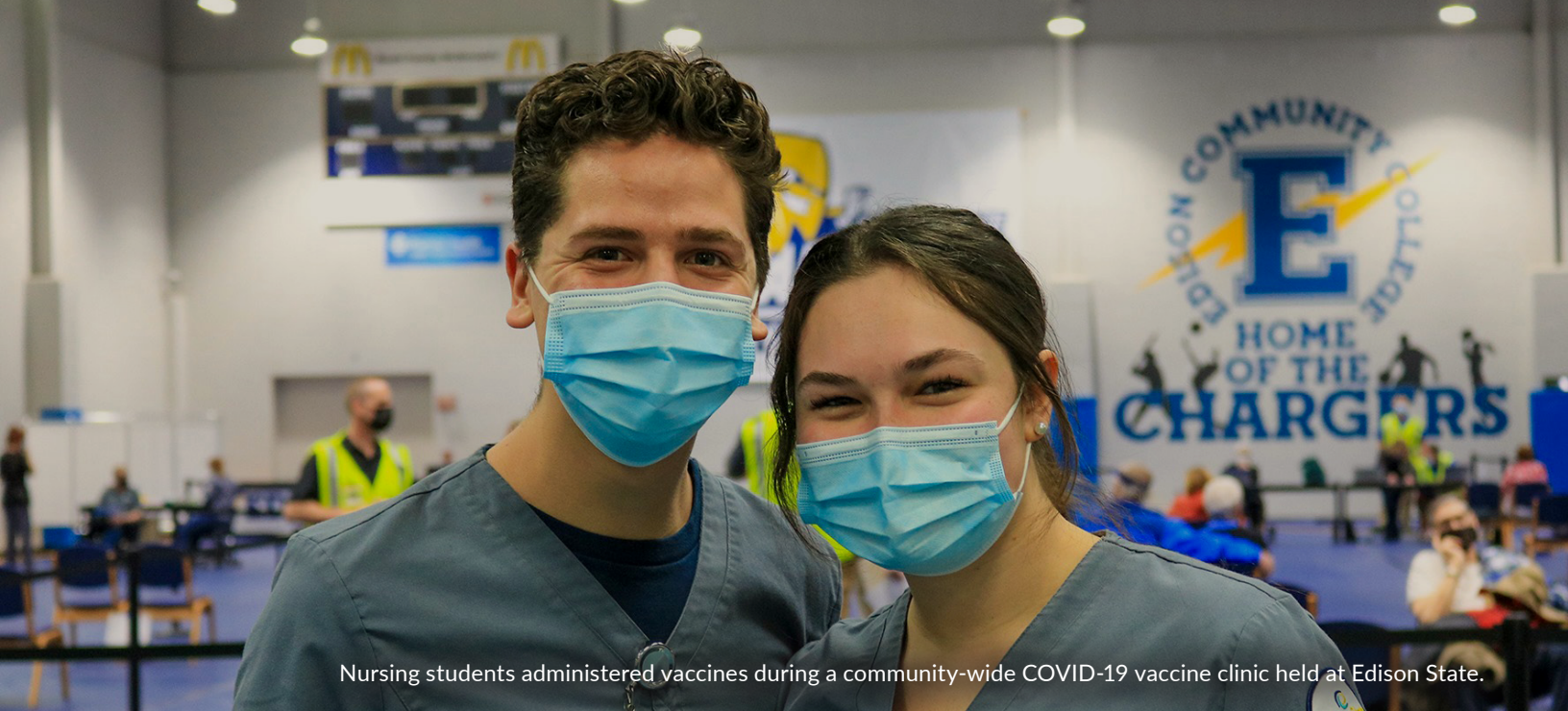
Nursing students administered vaccines during a community-wide COVID-19 vaccine clinic held at Edison State.